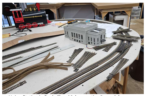
Union Station in Rockville with locomotive (to scale)