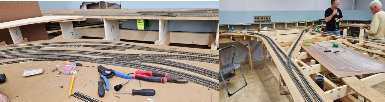
The elevated section heading to Port Charles (upper)

Here are some overall photos of the progress.