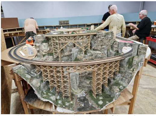
The waterfall and trestle at the end of the coal mine

While placing the representation of the power house for the papermill, the alert signal that will indicate occupancy on the drill track was illuminated. The sample oversized windows are being tested to meet the prototype building sample.